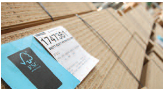
Melamine faced chipboard

Fuel efficient Euro 6 delivery vehicles are used with an additional tank for Ad blue additive that results in not only meeting stringent emissions targets but comfortably falling under emission limits. A logistics software package is used to plan delivery routes ensuring the most efficient delivery route is calculated between deliveries.