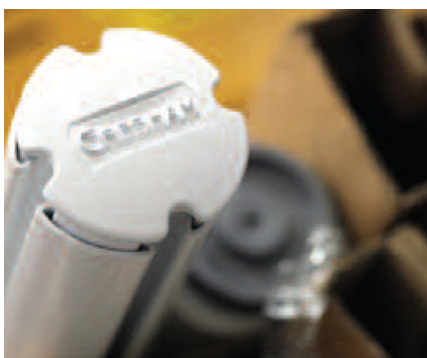
Steel recycled by local company