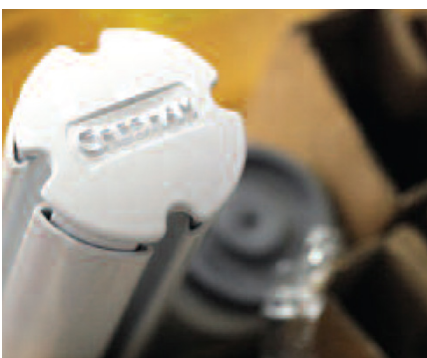
Steel recycled by local company