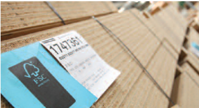
Melamine faced chipboard

Fuel efficient Euro 6 delivery vehicles are used with an additional tank for Ad blue additive that results in not only meeting stringent emissions targets but comfortably falling under emission limits. A logistics software package is used to plan delivery routes ensuring the most efficient delivery route is calculated between deliveries.