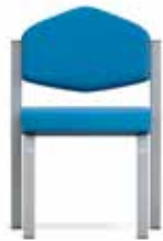
210S 4 Leg Heavy Duty (Stackable)