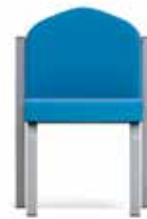
310S 4 Leg Heavy Duty with Mid Back