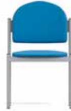
LOS1 4 Leg Heavy Duty (Stackable)