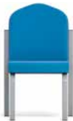
410S High Back 4 Leg Stacking