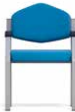
220M 4 Leg Heavy Duty with Moulded Arms