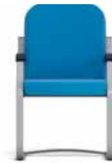
440M High Back Cantilever