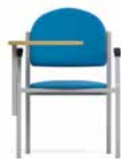
120MWT 3/4 Back with Moulded Arms and Writing Tablet