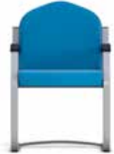
340M Cantilever Heavy Duty with Moulded Arms