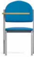
110SWT 4 Leg Heavy Duty with Swivel Writing Tablet (Fits Either Side) (Stackable)*