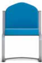
330 Cantilever Heavy Duty