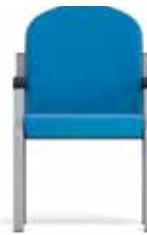
420M High Back 4 Leg with Moulded Arms