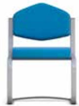
230 Cantilever Heavy Duty with 3/4 Back