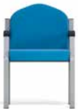
320M 4 Leg Heavy Duty with Moulded Arms