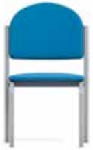
110C 4 Leg Heavy Duty with Curved Front Legs (Stackable)