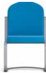
430 High Back Cantilever