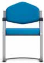
240M Cantilever Heavy Duty with 3/4 Back and Arms