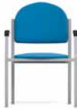
120SM 4 Leg Heavy Duty with Moulded Arms (Stackable)