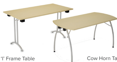
'I' Frame Table