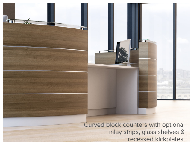
Curved block counters with optional inlay strips, glass shelves & recessed kickplates.

We offer a unique service to our clients in having both a state-of-the-art production facility that can be used to produce standard and special pieces of furniture, whilst our Bespoke Division complements this with handmade items. Our specialist craftsmen can be called on to fabricate intricate pieces using materials such as solid and veneered wood, laminates and solid surface products, such as Corian.