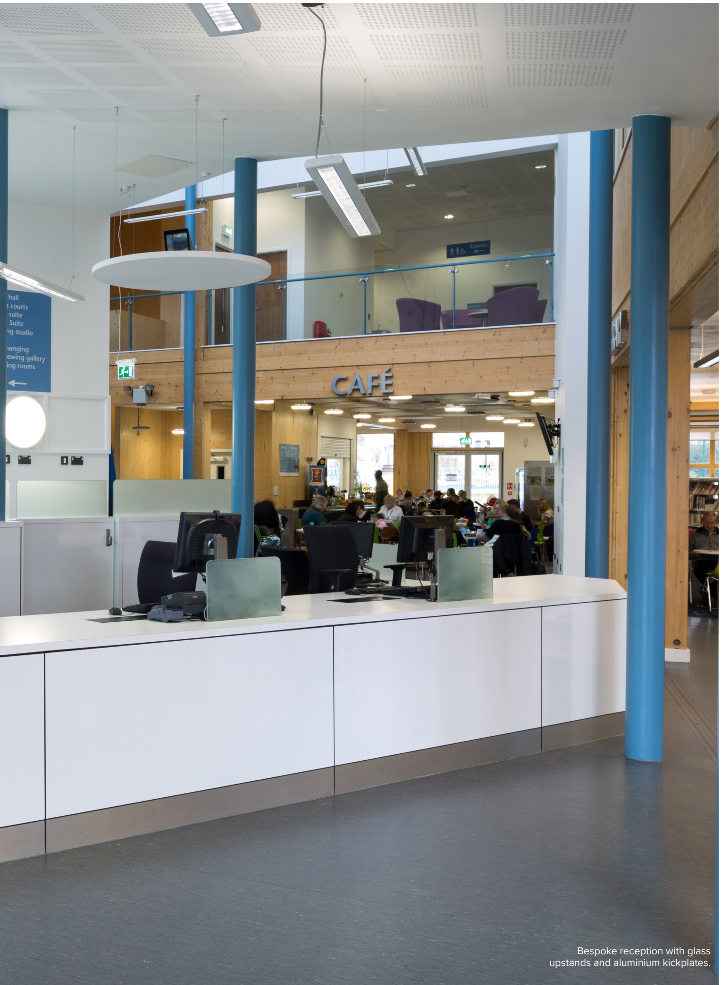
Bespoke reception with glass upstands and aluminium kickplates.