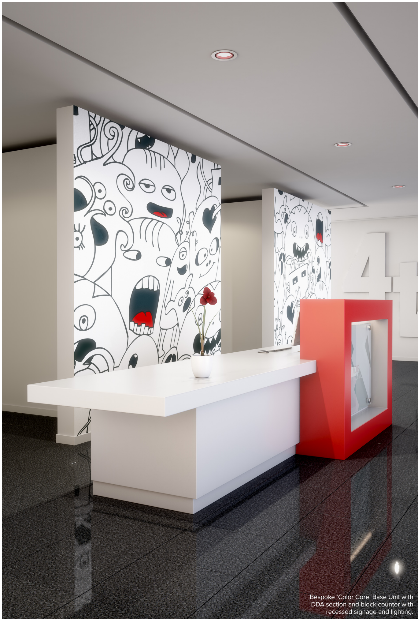
Bespoke 'Color Core' Base Unit with DDA section and block counter with recessed signage and lighting.