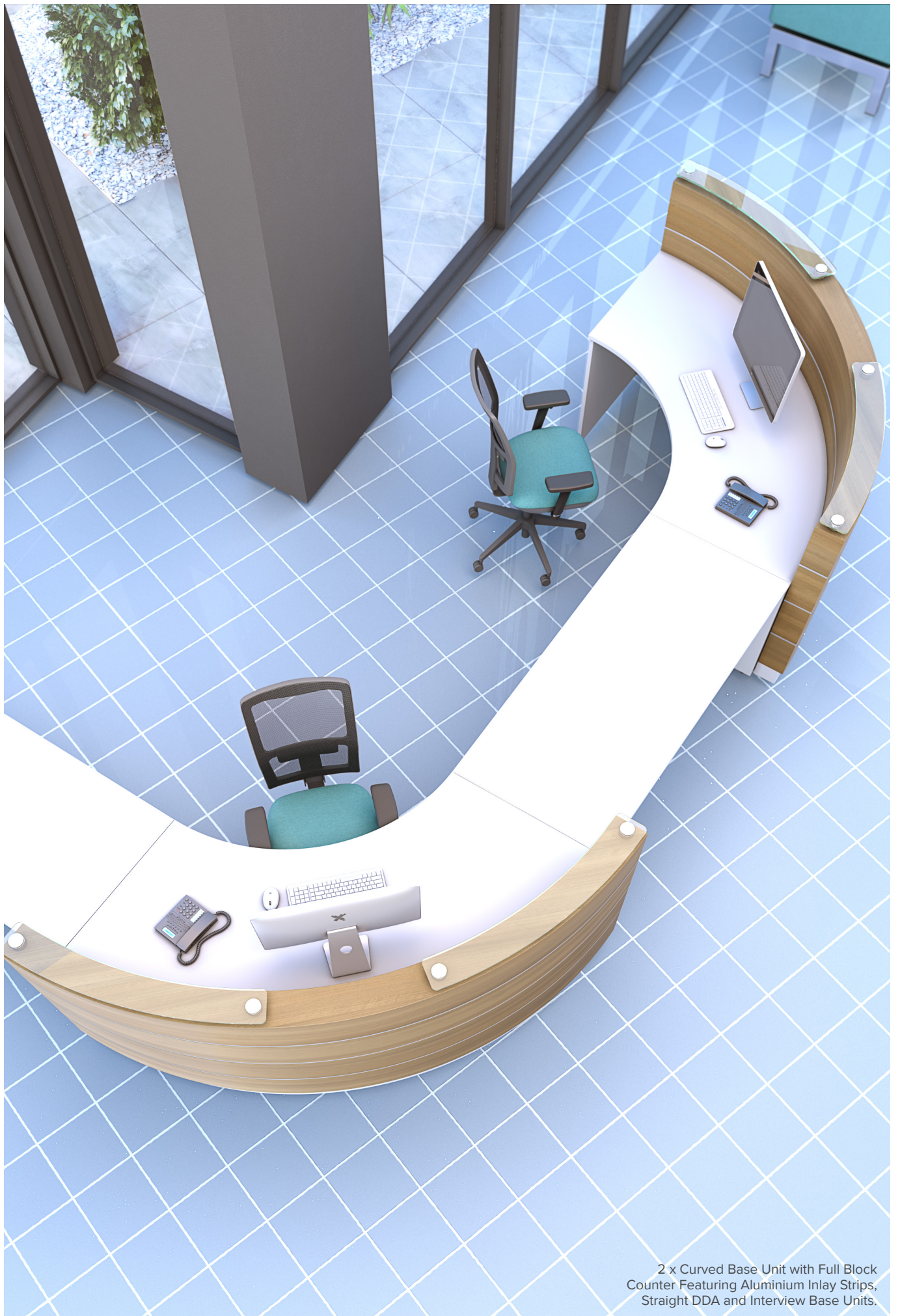
2 x Curved Base Unit with Full Block Counter Featuring Aluminium Inlay Strips, Straight DDA and Interview Base Units.