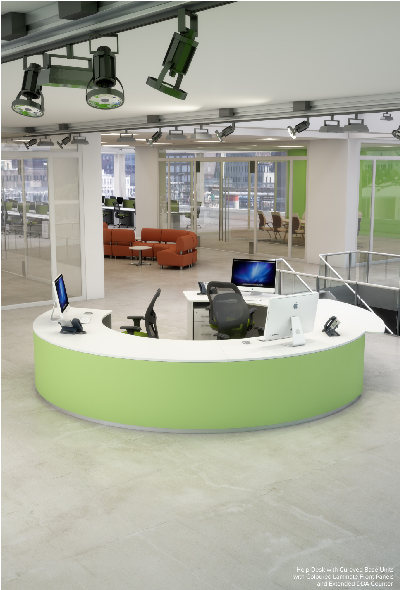
Help Desk with Curved Base Units with Coloured Laminate Front Panels and Extended DDA Counter.