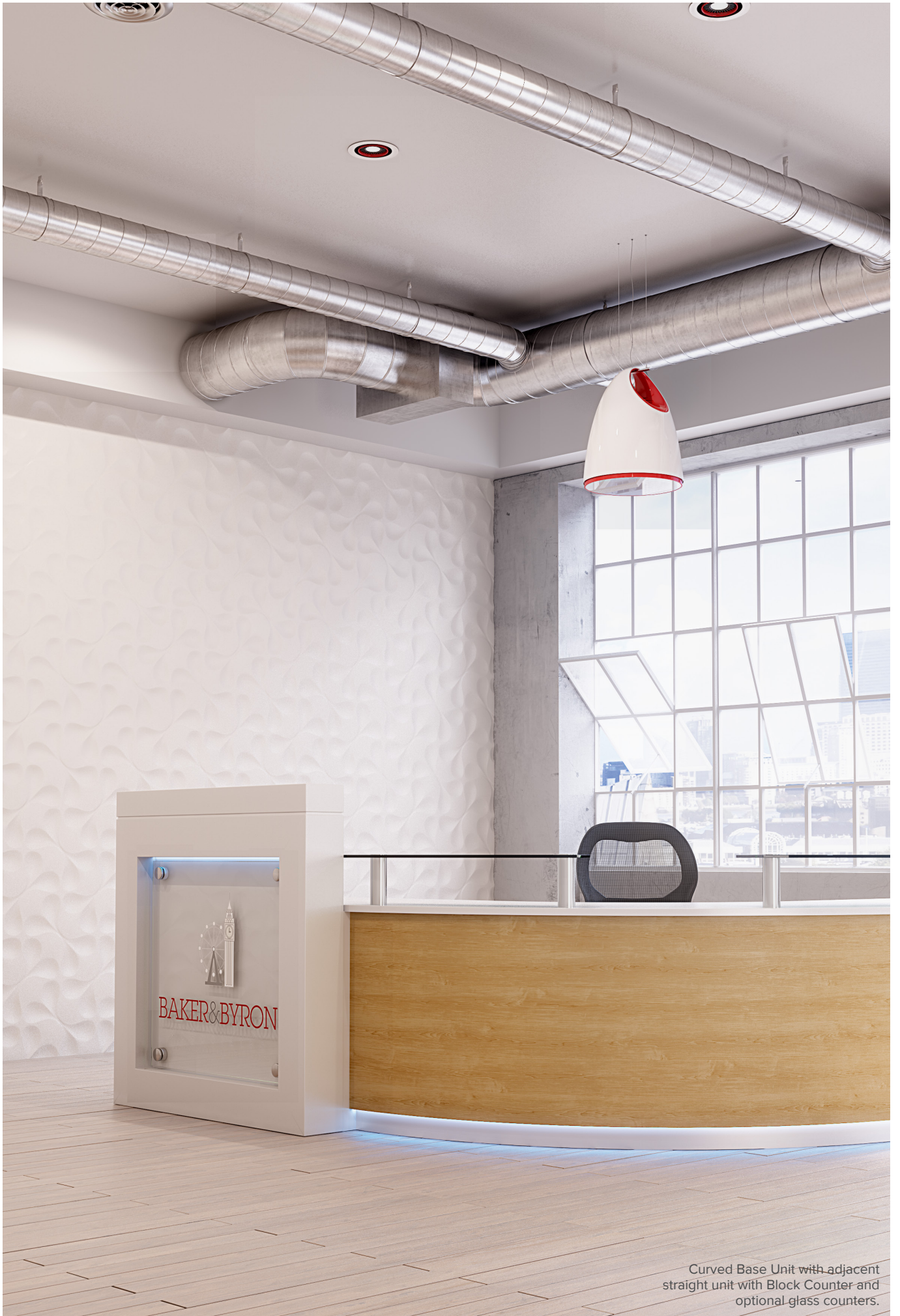
Curved Base Unit with adjacent straight unit with Block Counter and optional glass counters.