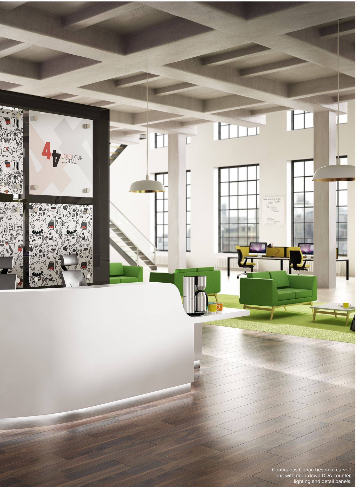
Continuous Corian bespoke curved unit with drop-down DDA counter, lighting and detail panels.