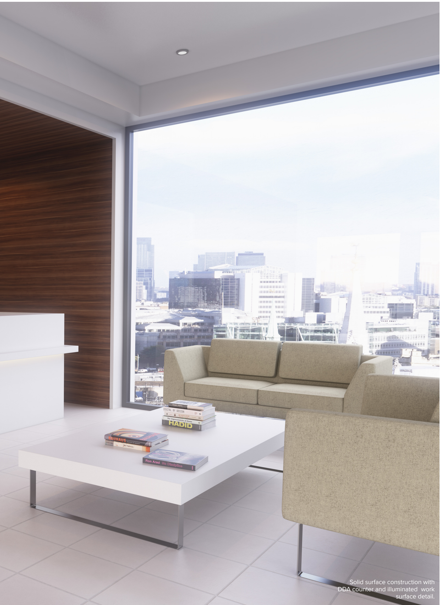
Solid surface construction with DDA counter and illuminated work surface detail.