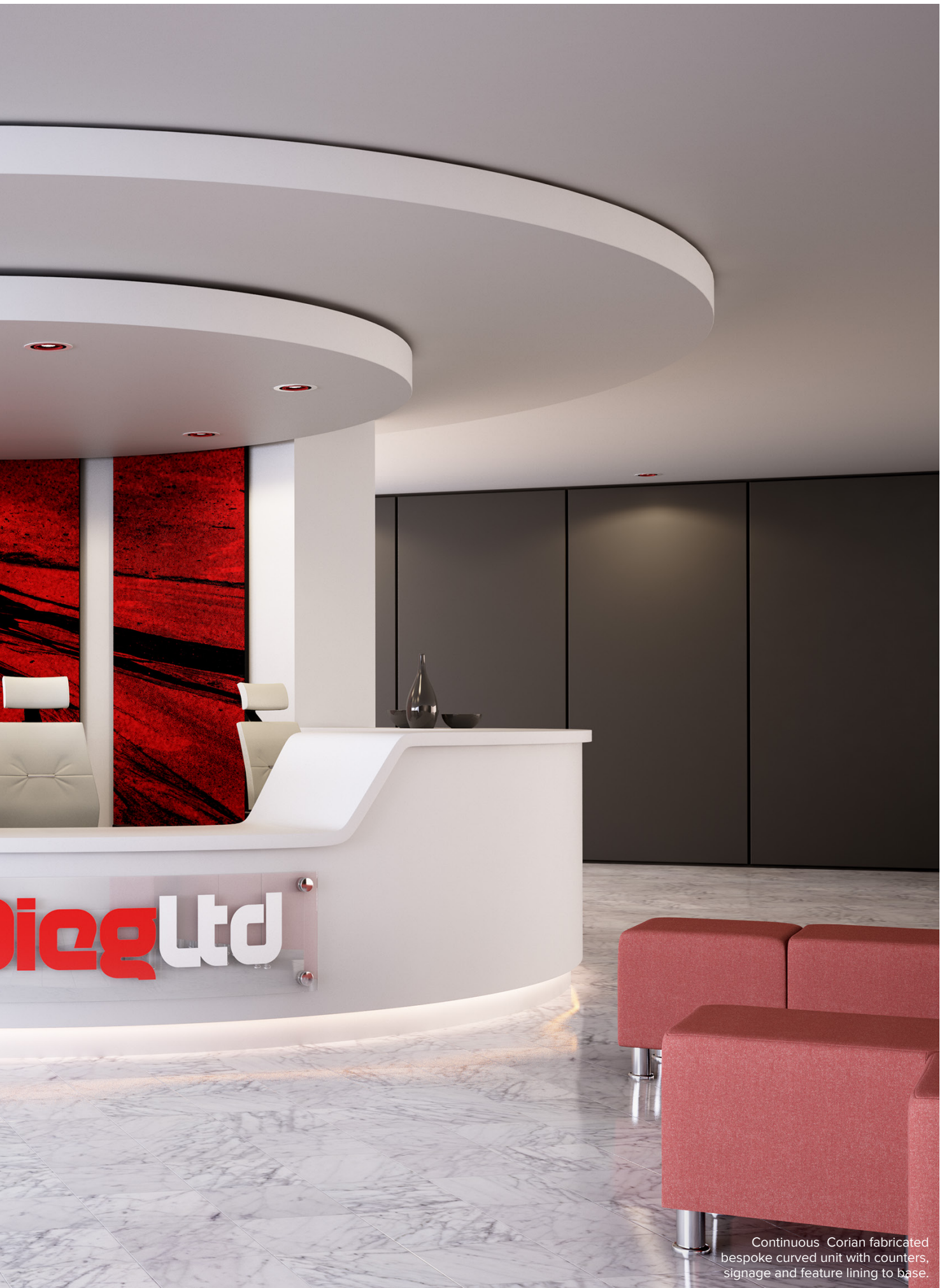
Continuous Corian fabricated bespoke curved unit with counters, signage and feature lining to base.