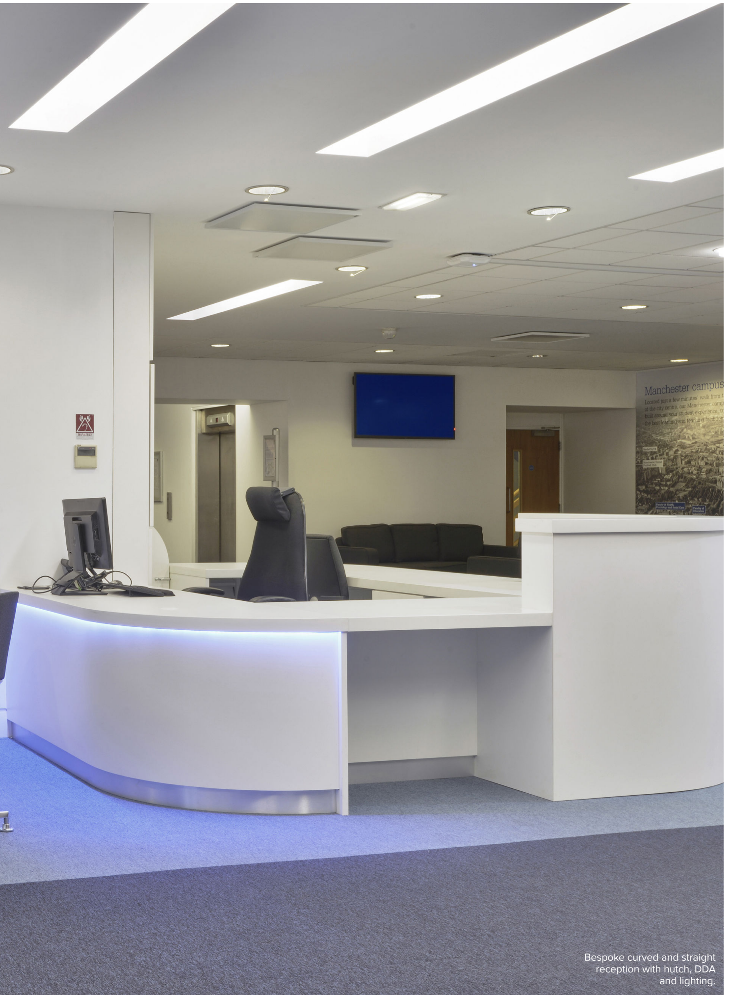
Bespoke curved and straight reception with hutch, DDA and lighting.