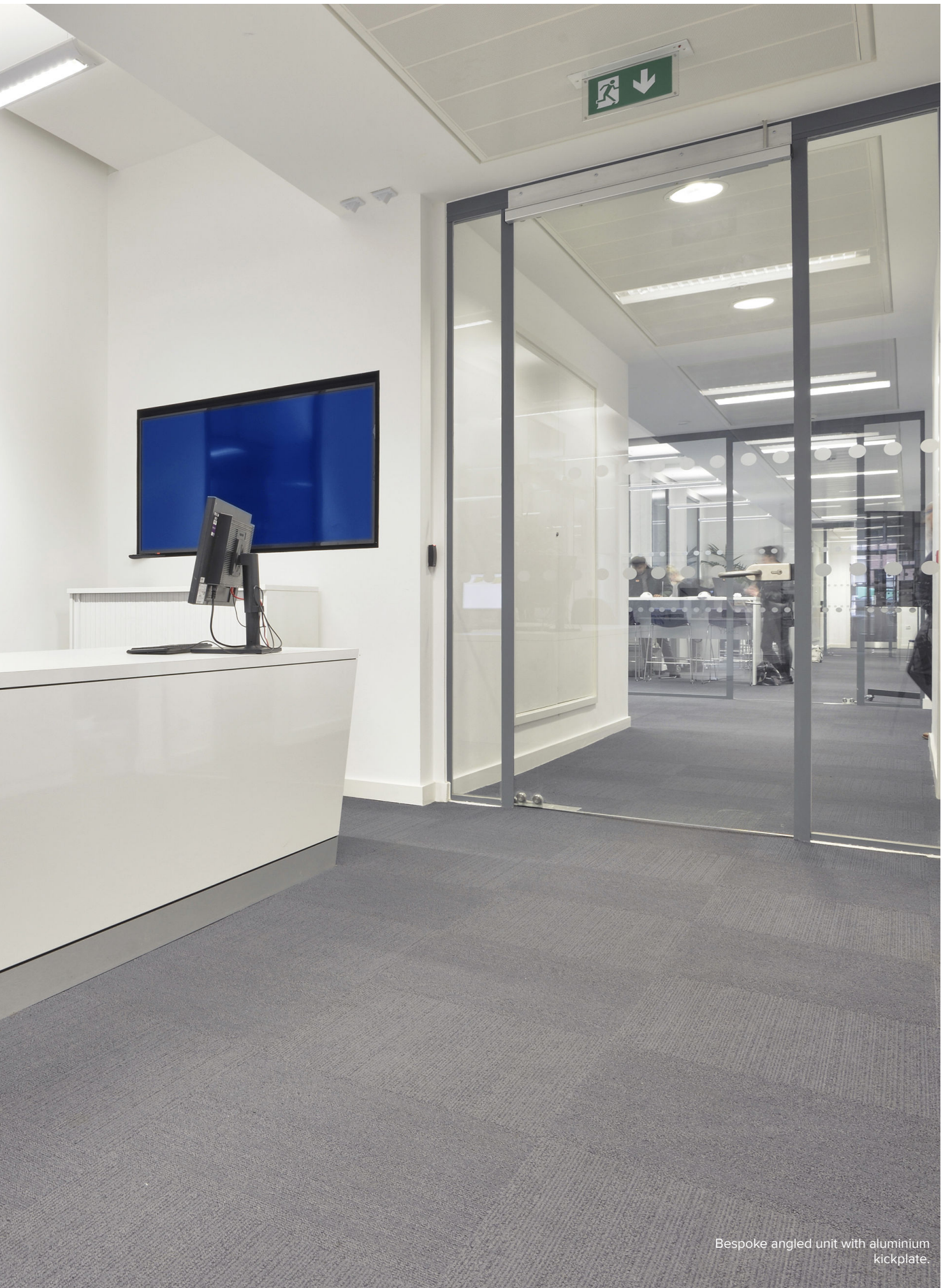
Bespoke angled unit with aluminium kickplate.