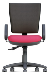
PSQM/3A2 Medium Back Black Fixed Arms