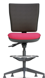
PSQMD/8 Medium Back Draughting Chair (Glides)