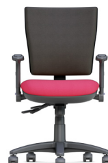
PSQM/3A13 Medium Back Height Adjustable Foldable Arms