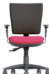
PSQM/3A8 Medium Back Black Height Adjustable Arms