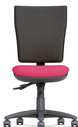
PSQH/3 High Back