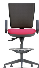
PSQMD/8A2 Medium Back Draughting Chair Black Fixed Arms (Glides)