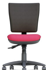
PSQM/3 Medium Back