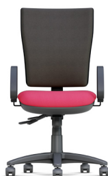
PSQH/3A2 High Back Black Fixed Arms