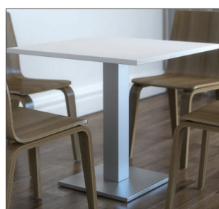
Flat Brushed Stainless Steel Base