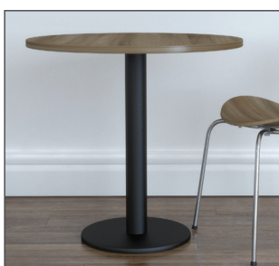
Round Black Base