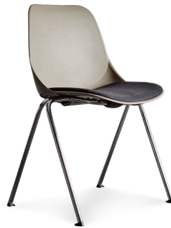
LS36A A Frame