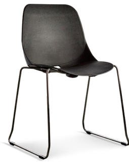
LS36C Sled Leg Frame