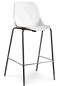
LS36D 4 Leg Stool 755mm Seat Height