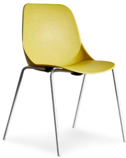
LS36B 4 Leg Frame

LS36 combines one single shell with several different frames, creating a versatile and multipurpose seating family. LS36 is suitable for use in meeting, waiting and conference rooms, and also in hospitality where it is perfect for cafeterias and bars. Upholstered seat pad is available in a variety of fabrics.