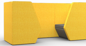
TKBM082 2 user 2 tier, 1200mm high