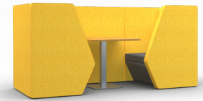
TKBM082T 2 user 2 tier, 1200mm high with table