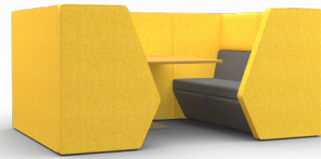
TKBM084T 4 user 2 tier, 1200mm high with table