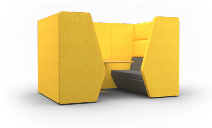
TKBL084T 4 user 3 tier, 1600mm high with table