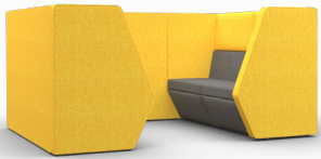
TKBM084 4 user 2 tier, 1200mm high