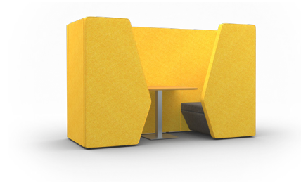
TKBL082T 2 user 3 tier, 1600mm high with table