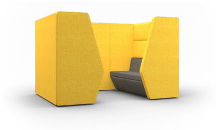
TKBL084 4 user 3 tier, 1600mm high