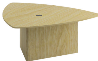
Static Panel Ended table with central cable port