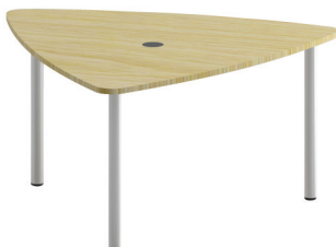
Static Metal Frame table with central cable port