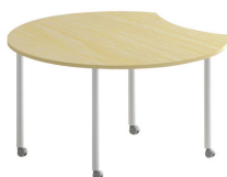
TPACS14 - Ø1400 x Ø1400 TPACS08 - Ø800 x Ø800