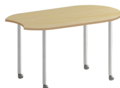
TTICS16 - Ø800 x 1600 x Ø800 TTICS08 - Ø800 x 1400 x Ø800