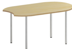
TTICS16 - Ø800 x 1600 x Ø800 TTICS08 - Ø800 x 1400 x Ø800