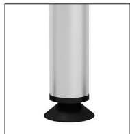
Static leg detail