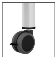
Mobile leg detail